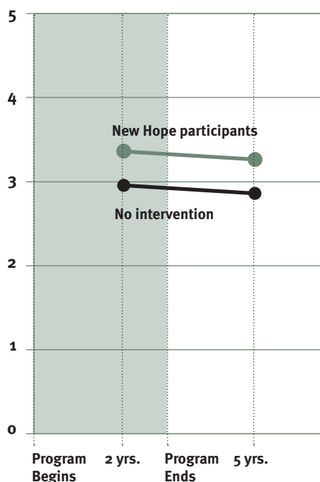
Boys in New Hope Rate Higher in School Achievement Over Time